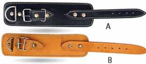
BI-514 LEATHER ANKLE

Metallic hooks covered in corduroy fabric, Adjustable hook & loop web straps Sizes: One Size Colour: Available in any color combination