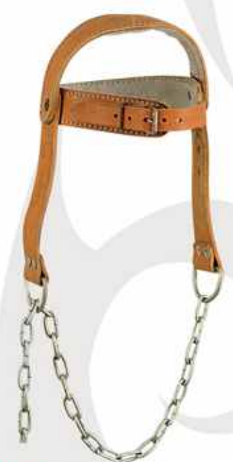
BI-512A HEAD HARNESS

Made of split leather with metallic chains Sizes: One Size