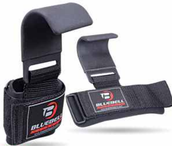
BI-264 LAT HOOK LIFTING STRAPS

Made of grippy rubber, Adjustable hook & loop web straps Sizes: One Size Colour: Available in any color combination