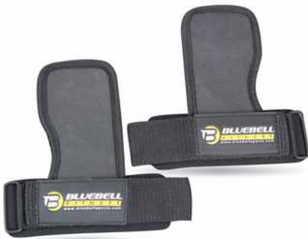
BI-3504 LIFTING GRIP PADS

Made of grippy rubber, Adjustable hook & loop web straps Sizes: One Size Colour: Available in any color combination