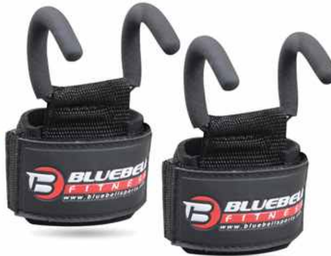
BI-3502 POWER LIFTING HOOKS

Ankle weight leather made Sizes: One Size Colour: Available in any color combination