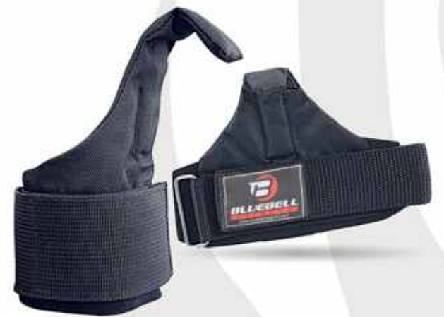
BI-503 POWER LIFTING HOOKS

Rubber coated metallic hooks, Adjustable hook & loop web straps Sizes: One Size Colour: Available in any color combination