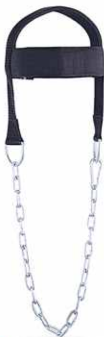
BI-2964 HEAD LIFTER

Made of strong corduroy material with locking carabiners for secure hanging Sizes: One Size