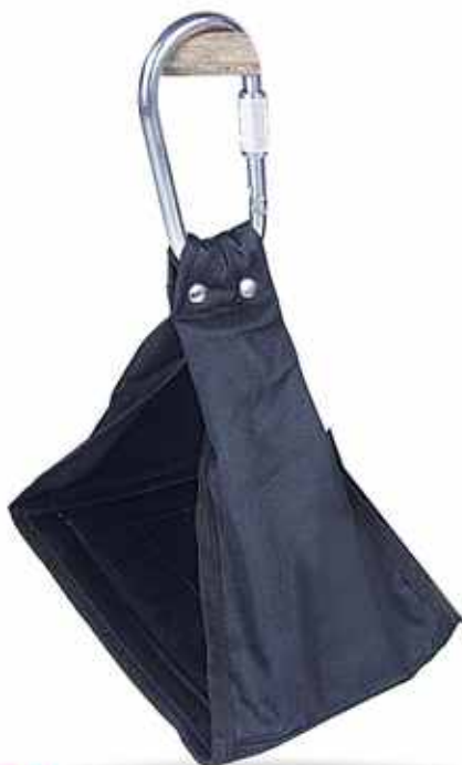
BI-520 ABDOMINAL SLING

Rubber coated metallic hooks, Adjustable hook & loop web straps Sizes: One Size Colour: Available in any color combination