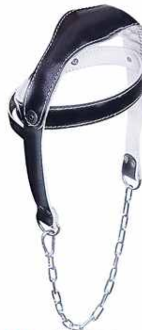
BI-512 HEAD HARNESS

Made of strong nylon web & neoprene pads, metallic chain Sizes: One Size